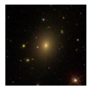
Markarian 501 galaxy

Sloan Digital Sky Survey on Wikimedia Commons. License CC-BY.