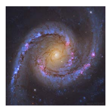
Spanish Dancer galaxy