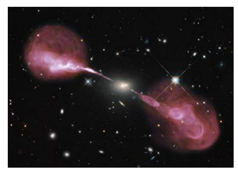
Hercules A galaxy