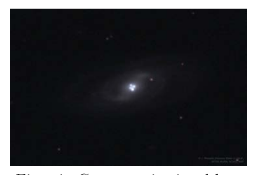
Einstein Cross gravitational lens